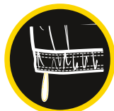
ELASTICATED HEM WITH SIDE ADJUST