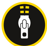
YKK MAIN ZIP LIFETIME WARRANTY