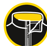
STAND UP COLLAR