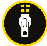
ZIPS MADE FROM RECYCLED MATERIAL