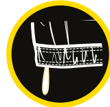
ELASTICATED HEM WITH SIDE ADJUST