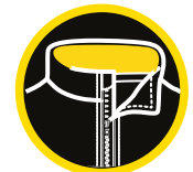
STAND UP COLLAR