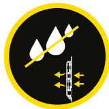
WATER RESISTANT & BREATHABLE