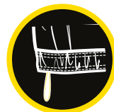
ELASTICATED HEM WITH SIDE ADJUST