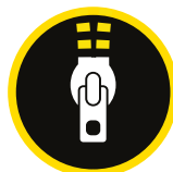
YKK MAIN ZIP LIFETIME WARRANTY