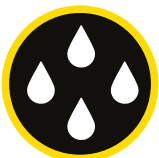
WATER RESISTANT FABRIC