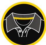
TAPED NECKLINE FOR COMFORT