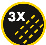
TRIPLE STITCHED SEAMS