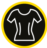
BUST DARTS FOR BETTER SHAPE